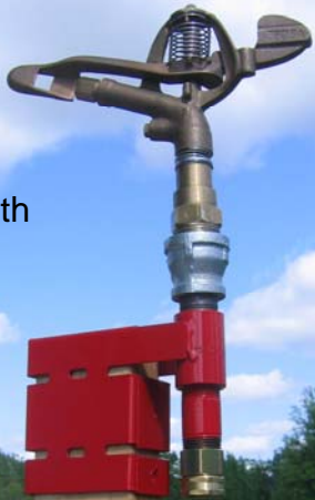
Elevated Sprinkler Mount with #350 SA Buckner