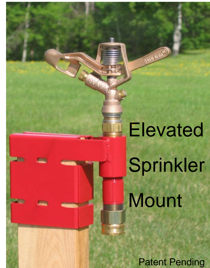
Elevated Sprinkler Mount